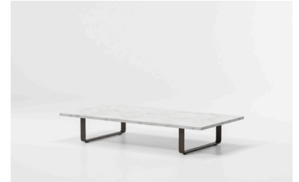
Marble top version